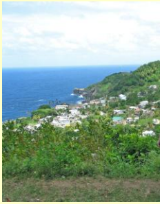
Fancy, St. Vincent & the Grenadines